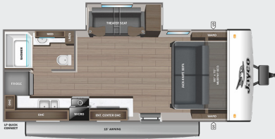
19MRK OPTION: C