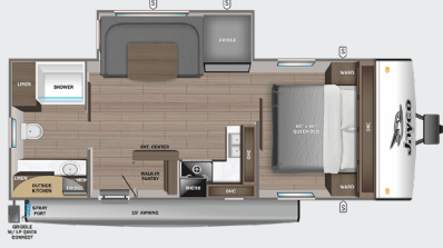
22RB OPTION: B