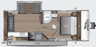
24RL OPTIONS: A, B, C