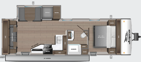
26RL OPTIONS: A, C