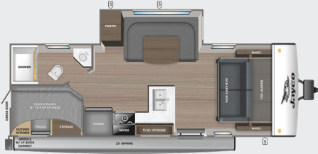
21MBH OPTION: B