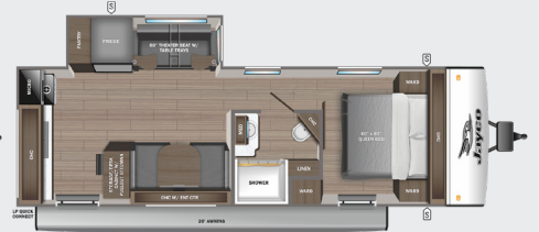
23RK OPTIONS: A, C