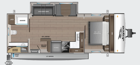
25RB OPTIONS: A, B