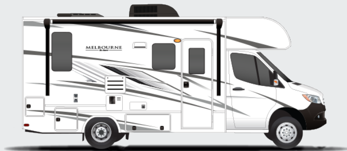
Standard Graphics Package