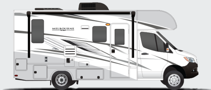
Optional Partial Paint