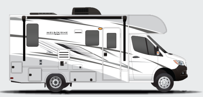
Optional Partial Paint