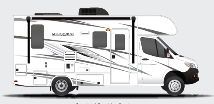
Standard Graphics Package