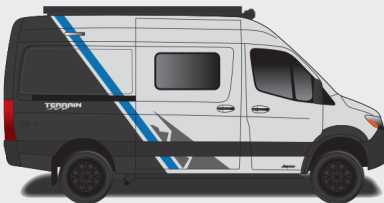
Optional Aztec Partial Paint (Silver Van Only)