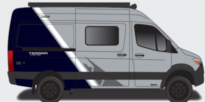
Optional Mystic Tide Partial Paint (Blue-Grey Van Only)