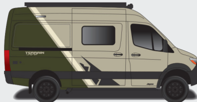
Optional Forest Glade Partial Paint (Sandstone Van Only)